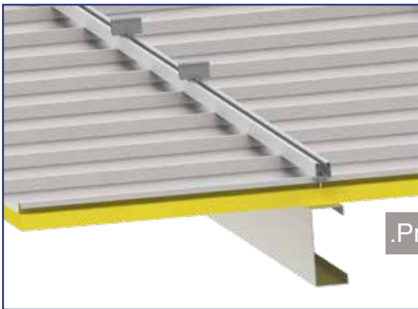
.Profile mounting to roof with drilling screw.