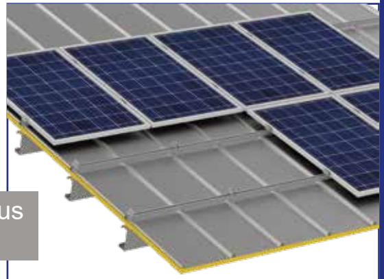
.Roof and panel mounting with the c-plus mounting profiles.