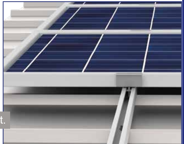
.Profile mounting to clamps with cage nut.